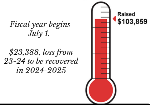
2023-2024 Total Raised

We anticipate that 2024-2025 fundraising needs will decrease due to the Lord's provision of increased enrollment